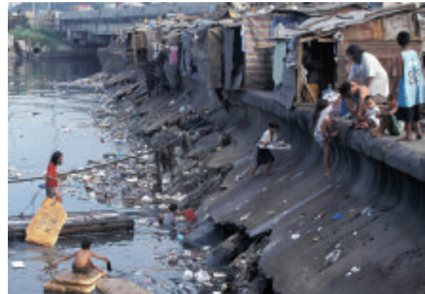
Children collecting floating waste from a polluted river in Manila Bay, Philippines

The Trade and Investment White Paper 14 deals more comprehensively with the question of how we can harness the power of globalisation, not only in the UK but in every country, especially in the developing world.