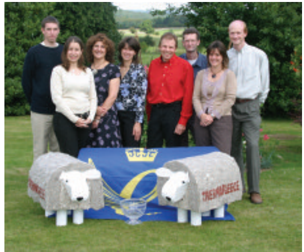
'Thermafleece': Second Nature UK Ltd – winners of the 2004 Queen's Award for Enterprise in the sustainable development category, for its innovative insulation product

This will help to raise the game in using policy tools like public procurement specifications, minimum standards and publicly available information about the environmental performance of different products. It will also help to embed the 'environmental impact assessment' of products as a regular feature of good business practice.