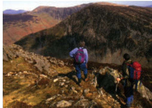
Ramblers on hillside looking over valley

Tourism is one of the world's largest industries, accounting for nearly an eighth of global Gross Domestic Product. It is one of the more complex, cross-cutting areas of economic activity, with huge social and environmental interactions, that needs to be approached from the perspective of sustainable consumption and production. For example, it has massive potential to support the economic and social development of poorer countries. At the same time, there is a need to minimise the potential which tourism also has for damaging the environment and indigenous cultures.