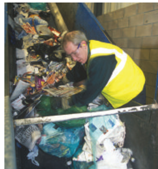
Material recycling facilities, UK